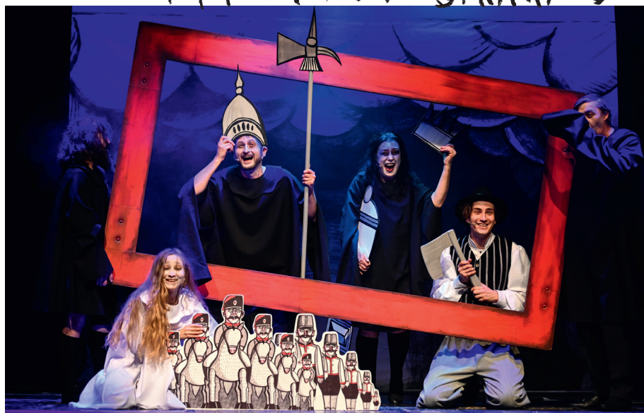
What's up with the Devil