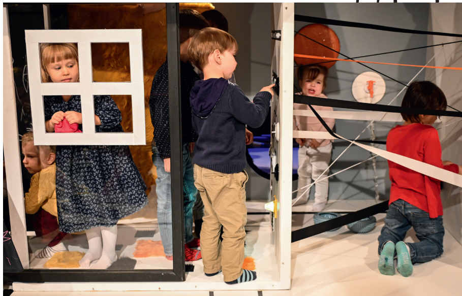
Children playing in the set of Here is the House