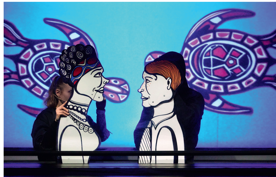
Atlas of Remote Islands

The theatre's repertoire is supplemented by events which accompany premieres or which are co-produced with other cultural institutions, publishers or non-governmental organisations. These include family workshops, open meetings, panels and debates, book fairs, festivals or theatre shows.